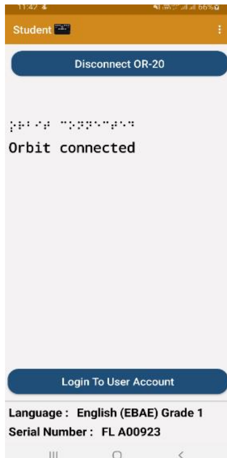
Figure-3: Home Screen showing the mirrored text of OR-20 display

Once the connection is established, the “Connect to OR-20” button turns into the “Disconnect OR-20” button. To disconnect the OR-20, tap the same. To manually disconnect from the OR-20 keypad, press SPACE + D (Dots 1 4 5 7).